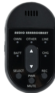
XD Teacher Microphone